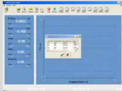
United's DATUM materials Testing Control Program Screen